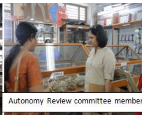
Autonomy Review committee member