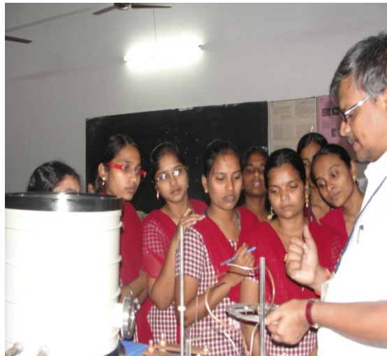
A mini workshop on thin films