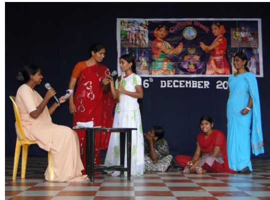
11. Alumni Meet/ Star Meet 19 th Jan, 2013.