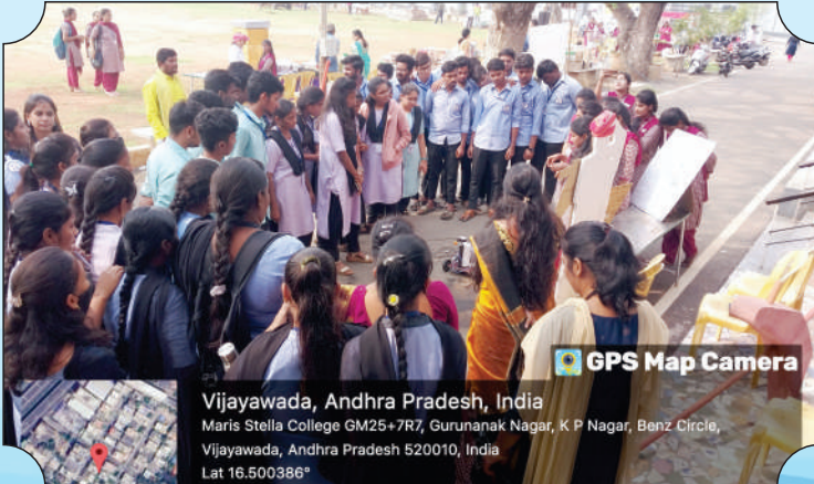
Smart Robotic Sprayer - Innovation of A & R Students