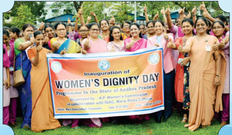
Women's Dignity Day