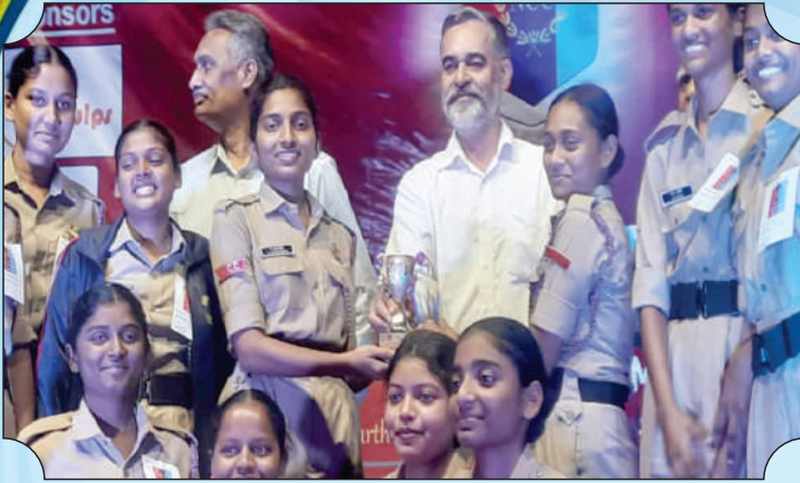
1st Prize in Drill Competition