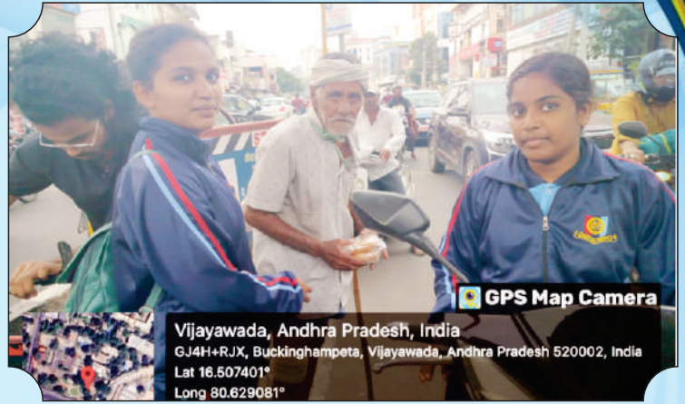
International Day of People with Disability