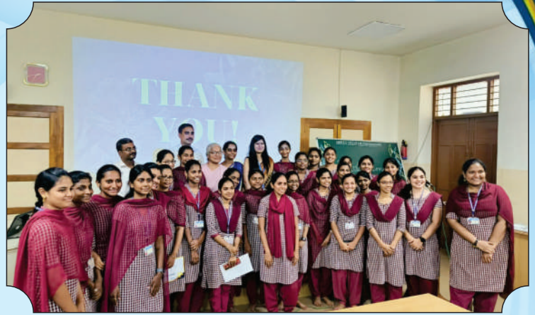
Bajaj Fin Serv Certificate Award