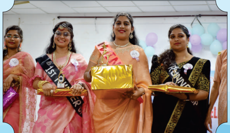
Winners of Miss Maris Stella

Vijayawada, Andhra Pradesh, India Maris Stella College GM25+7R7, Gurunanak Nagar, K P Nagar, Benz Circle, Vijayawada, Andhra Pradesh 520010, India Lat 16.500386°